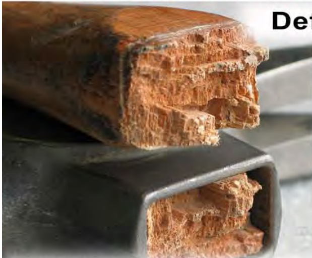
Poor grain structure; fibers broke off clean, no splintering in break. Break caused by bad grain. Covered under Warranty.