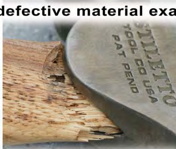
Good grain structure; fibers pulling & splintering, very jagged looking break. Break caused by user over-prying. Not covered by Warranty.