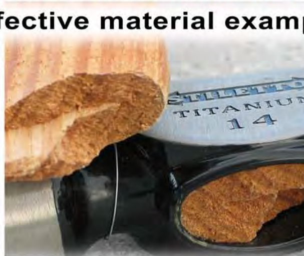
Poor grain structure; fibers broke off clean, no long sharp fibers. Break caused by bad grain. Covered under Warranty.