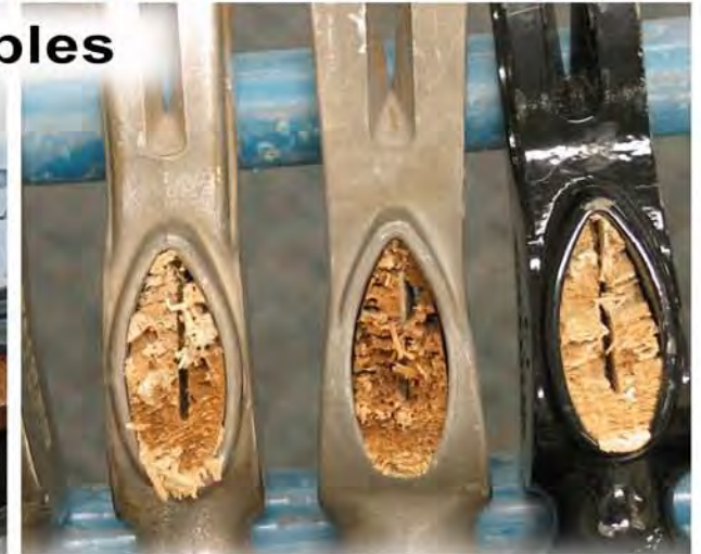
Poor grain structure; fibers broke off clean, material not pulled out of eye. Break caused by bad grain. Covered under Warranty.

All warranty claims must be reported to Stiletto Customer Service @ 800-987-1849 before action is taken.