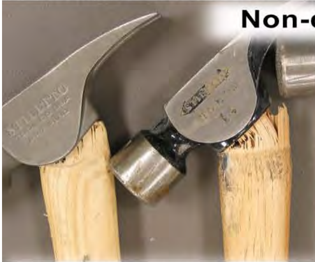
Good grain structure; fibers pulling & splintering, very long fibers in break. Break caused by user over-prying. Not covered by Warranty.