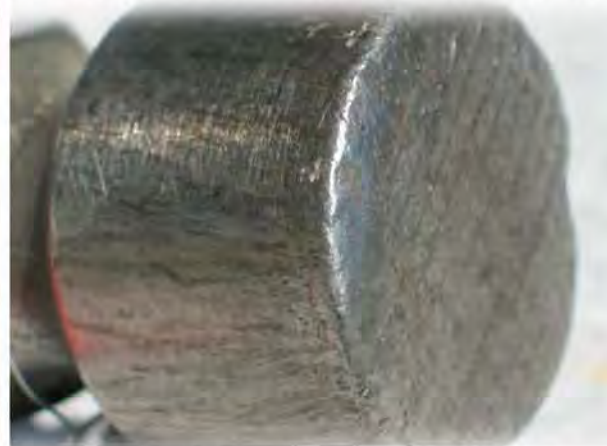
Face is worn and "mushroomed", or a lip is formed, by striking hardened steel tools such as Cats Paw or steel stakes. Damage not covered by warranty.