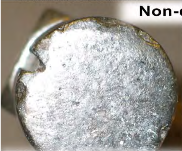
Face milling is worn out completely, chipping and pitting at edge of face, result of striking hardened Steel tools. Damage not covered by warranty.