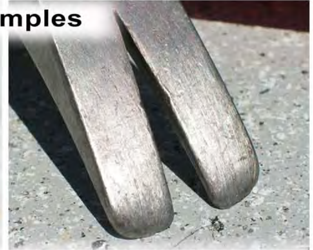
Claw tips worn down from chipping concrete or digging in rocky soil. Note scrapes, scratches, and indentations near claw tips. Damage not covered by warranty.

Any misuse, abuse, alteration, or normal service wear & tear is not covered by warranty.