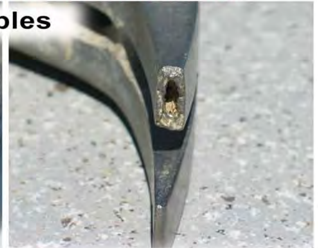
Tip of claw broken due to casting defects. No apparent abuse to tool. Covered under warranty.

All warranty claims must be reported to Stiletto Customer Service @ (800) 987-1849 before action is taken.